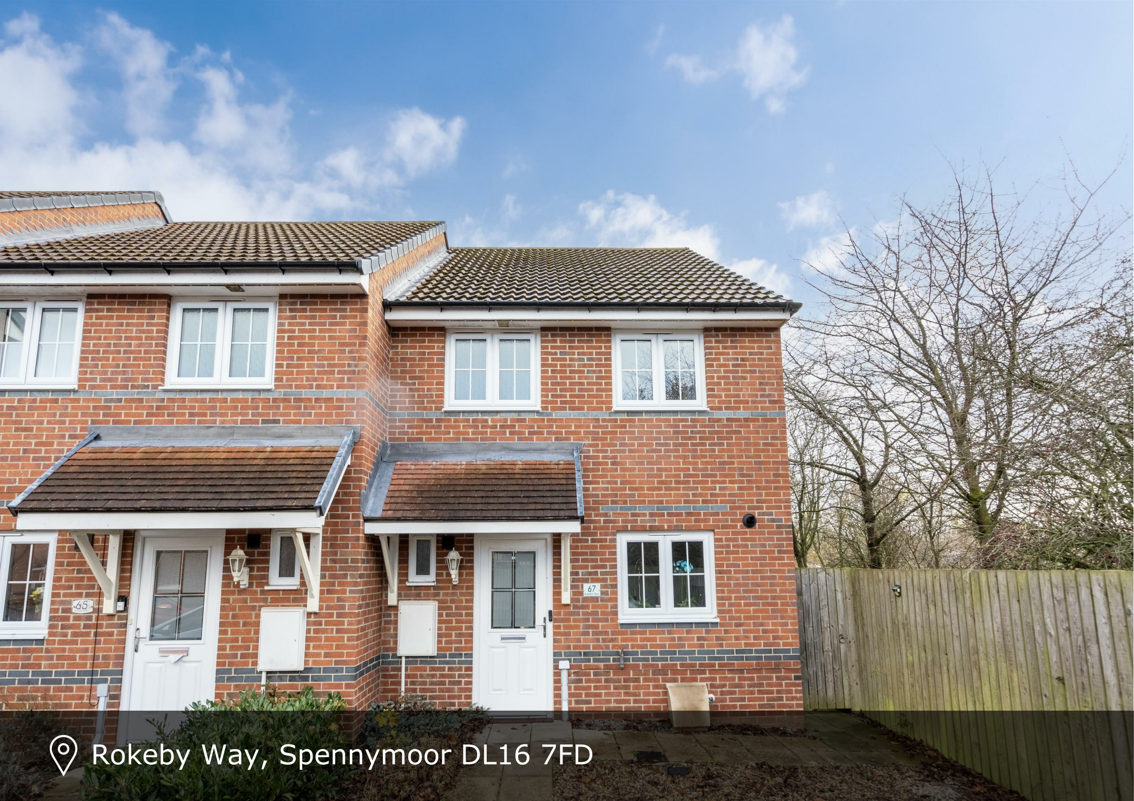
📍 Rokeby Way, Spennymoor DL16 7FD